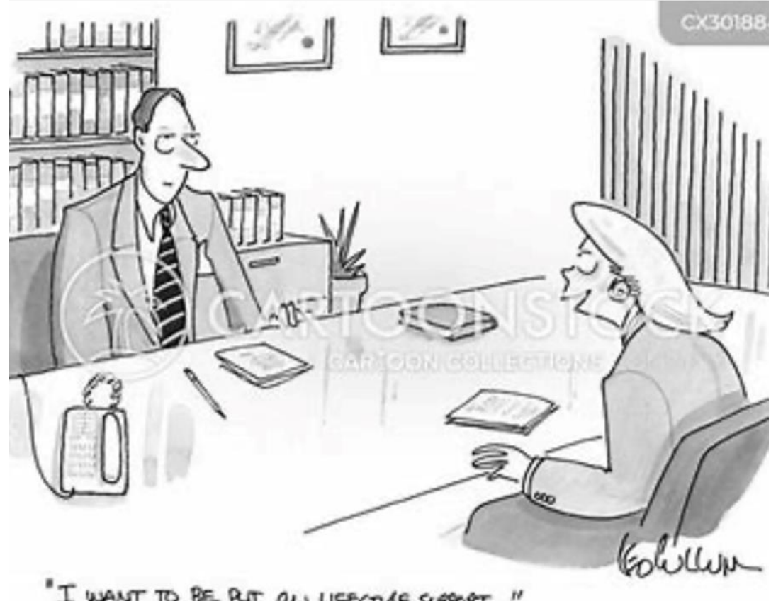
"I WANT TO BE PUT ON LIFESTY'S SUPPORT. "